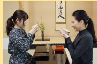
Hands-On Matcha and Japanese Sweets Making Plan From 3,950 yen