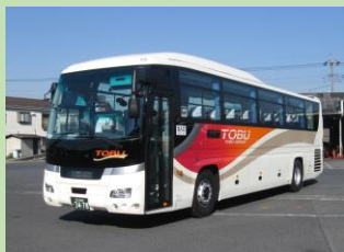
Skytree Shuttle Haneda Airport Line Plan From 2,550 yen