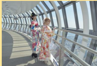
Kimono Rental Plan From 5,500 yen