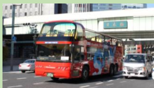
SKY HOP BUS Plan From 4,600 yen