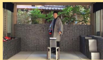
Karate Tile Breaking Plan From 4,700 yen