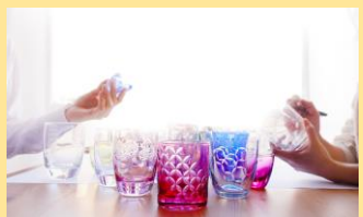
Edo Kiriko Glass Cutting Class Plan From 6,900 yen