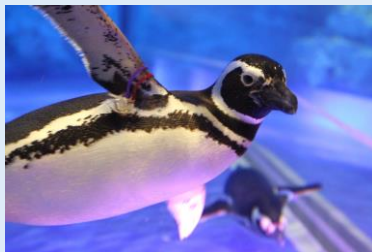
SUMIDA AQUARIUM Plan From 3,750 yen