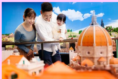
Miniature Museum SMALL WORLDS Plan From 3,950 yen