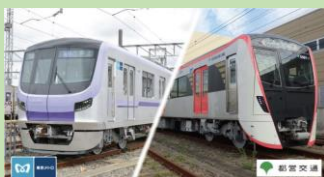
Tokyo Subway 24-Hour Ticket Plan (Unlimited rides on all Tokyo Metro and Toei Subway lines for 24 hours) From 2,350 yen