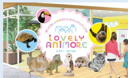
Lovely Animore Plan From 2,800 yen