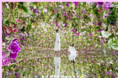
teamLab Planets TOKYO teamLab Planets TOKYO DMM Plan From 2,900 yen