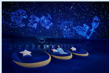
Planetarium "TENKU" Plan From 2,900 yen