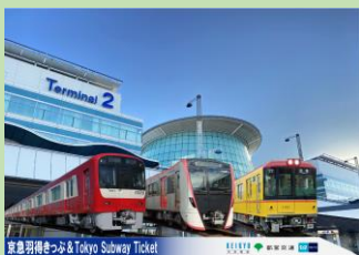
Keikyu Haneda Airport Ticket & Subway 24-Hour Unlimited Rides Combo Plan From 2,950 yen