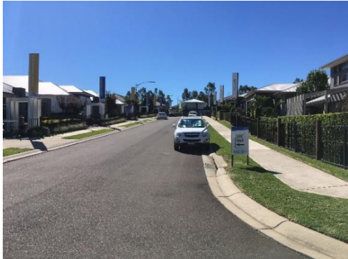
【Box Hill of the Future (nearby residential area) 】