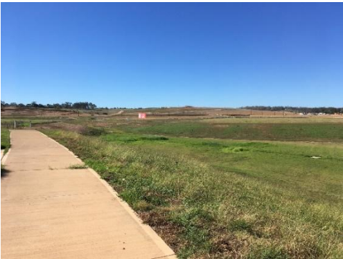
[Current view of Box Hill area]

In March of this year, the company completed construction work on quadruple tracks to fundamentally improve their transport network and solidify business infrastructure in the areas along their tracks. They also are engaging in promising markets in Japan and overseas as they work to capture new income streams and establish a growth cycle for the future. As part of their engagement in overseas markets, through this project the company will examine expanding their existing Group presence in Australia and also explore potential for business development in other areas overseas.