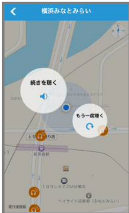
Fig. 5: Audio Guide screen