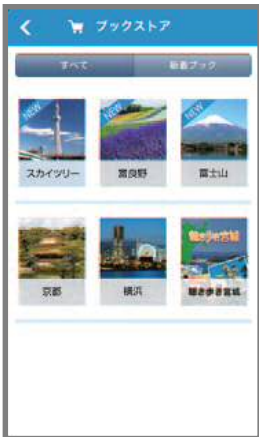
Fig. 4: Book Store screen