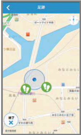
Fig. 6: Footprint screen

Using smartphones as a platform, SkyDesk Media Trek offers a wide range of uses. For example, not limited to providing tourist information, a local governments or non-profit organizations can offer community-specific information for local residents, such as information on traffic regulations and disaster hazardous areas in an audio format. Also, in outlet malls and other large commercial complexes, the service can be used to announce store information and events of the day.