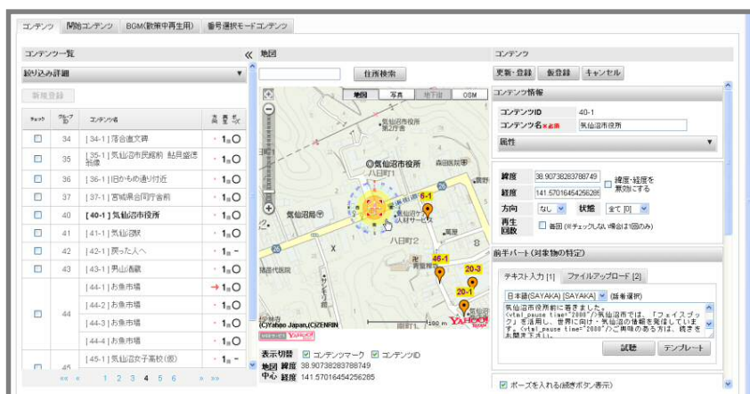
Fig. 2: Authoring Tool