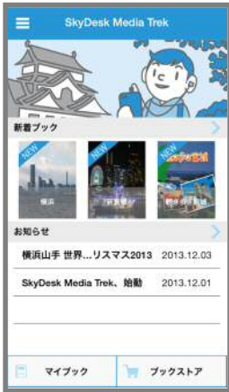
Fig. 3: Top screen

When the users play the downloaded contents and approach the registered location, the contents are played automatically. Additionally, the app records locations where the guides have been played as “Footprints”, so users can play these guides in a different location. (Fig. 3 to 6 )