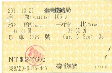
A ticket for TRA's Tze-Chiang limited express