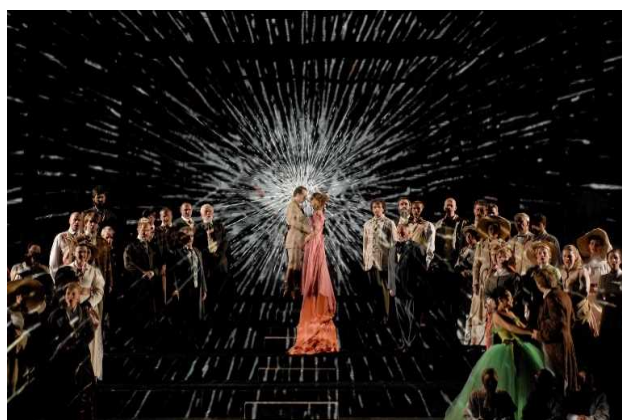
La Flûte enchantée (The Magic Flute) by W. A. Mozart

Production of Aix-en-Provence Festival and Rouen Opera, created by Theatre de la Monnaie in 2005