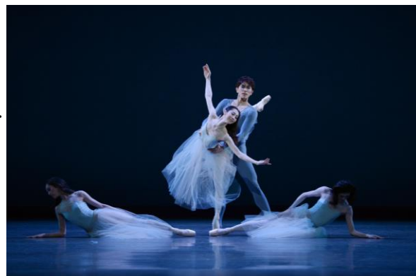
Serenade © The George Balanchine Trust