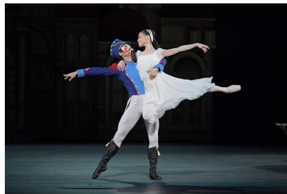
The Nutcracker and the Mouse King