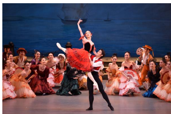
Don Quixote