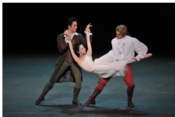
Manon