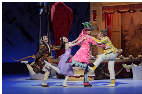
Alice's Adventures in Wonderland©