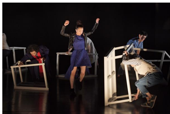
Onodera Shuji Company derashinera “Alice’s Adventures in Wonderland”