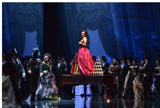
© Masahiko Terashi / New National Theatre, Tokyo