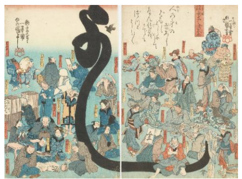
Utagawa Kuniyoshi / Ukiyo: World of "Yoshi" (1st term)