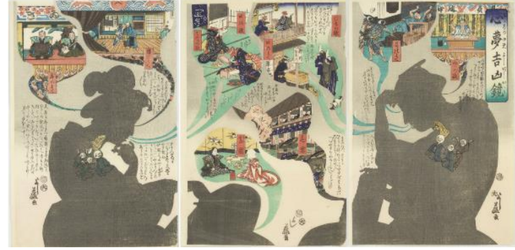
Utagawa Yoshifuji / Man and Woman: Dream Mirror Reflecting Good and Evil in the Heart (1st term)

Silhouettes of men and women were a fad at this period. In this example, the thoughts and desires of the man and woman depicted in silhouette are communicated in speech balloons expressing the desires of their ears, eyes, noses, mouths, and sexuality.