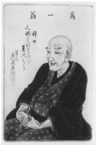
Keisai Eisen, Hokusai portrait , National Diet Library

Japanese Ukiyo-e artist Katsushika Hokusai (1760-1849) was born in Sumida, Tokyo. It is said that Hokusai moved more than 90 times during his 90-year life, spending most of his lifetime in Sumida, and left many works depicting the scenery of Sumida, including Ryogoku Bridge, Mimeguri Shrine, and Ushijima Shrine. He vividly captured life in the Edo Period and is best known for the series “ Thirty-six Views of Mount Fuji ” which includes representative Japan’s most iconic artwork “ Under the Wave off Kanagawa ”, known internationally as The Great wave . His fascinating life and varied works spanning more than 70 years are more highly regarded today than ever, 160 years after his death. Today, he and his works are in the limelight as one of the most acclaimed artists in the world.