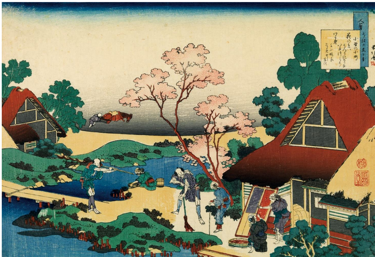
Katsushika Hokusai, Ono no Komachi , from the series One Hundred Poems Explained by a Nurse , The Sumida Hokusai Museum (1st term)

The Sumida Hokusai Museum's collection of One Hundred Poems Explained by a Nurse series will be exhibited with twenty-three paintings in the first and second halves of this exhibition !