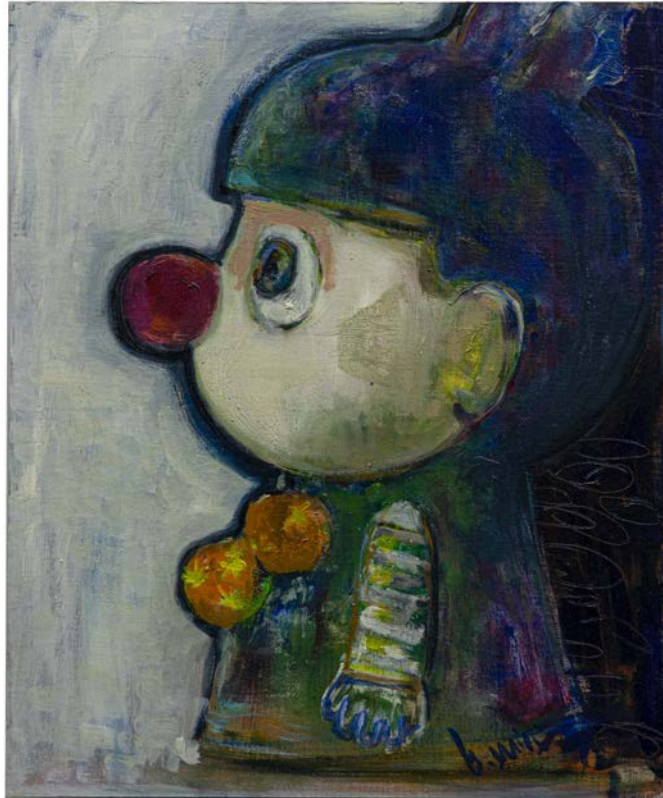
b.wing, The Party's Over? , 2021. Oil on Double Primed Linen (Claessens Linen Panels). 61 x 51 cm. Courtesy to b.wing and JPS Art Gallery.

JPS Area 36 is proud to present “ Something, changed. ”, an exhibition of paintings by b.wing, on view at the gallery’s Tokyo location. The exhibition marks the artist’s first solo show with the gallery, presenting a series of new paintings that the artist took inspiration from a childhood accident, exploring its effect in her artistic oeuvre and mentality.