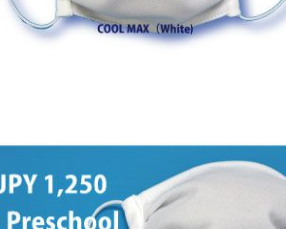
COOL MAX (White)